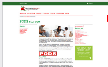
sample program sites